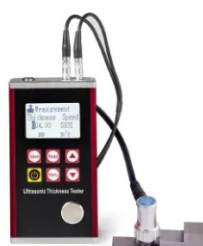
Measuring sound velocity